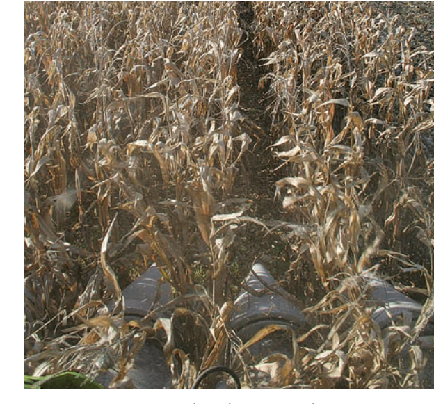
Harvesting is made with conventional equipment. Another advantage: as the overall inter row spacing is not modified, the tractor treads remain unchanged.

The crop is planted on two lines 20 cm apart instead of on one line with inter row spacings of 75 cm, 76,2 cm or 80 cm.